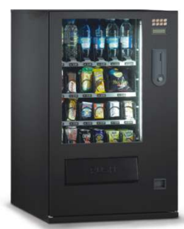
Vega 600 master.

CERT. N° 9105.BNVD CSQ ENAB ISO 9001:2000